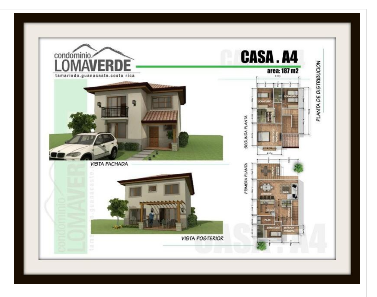
Casa A4 4 Bedroom / 3.5 Bath, Dining Room, Kitchen, Laundry Room and Terrace Introductory Price $ 197,500