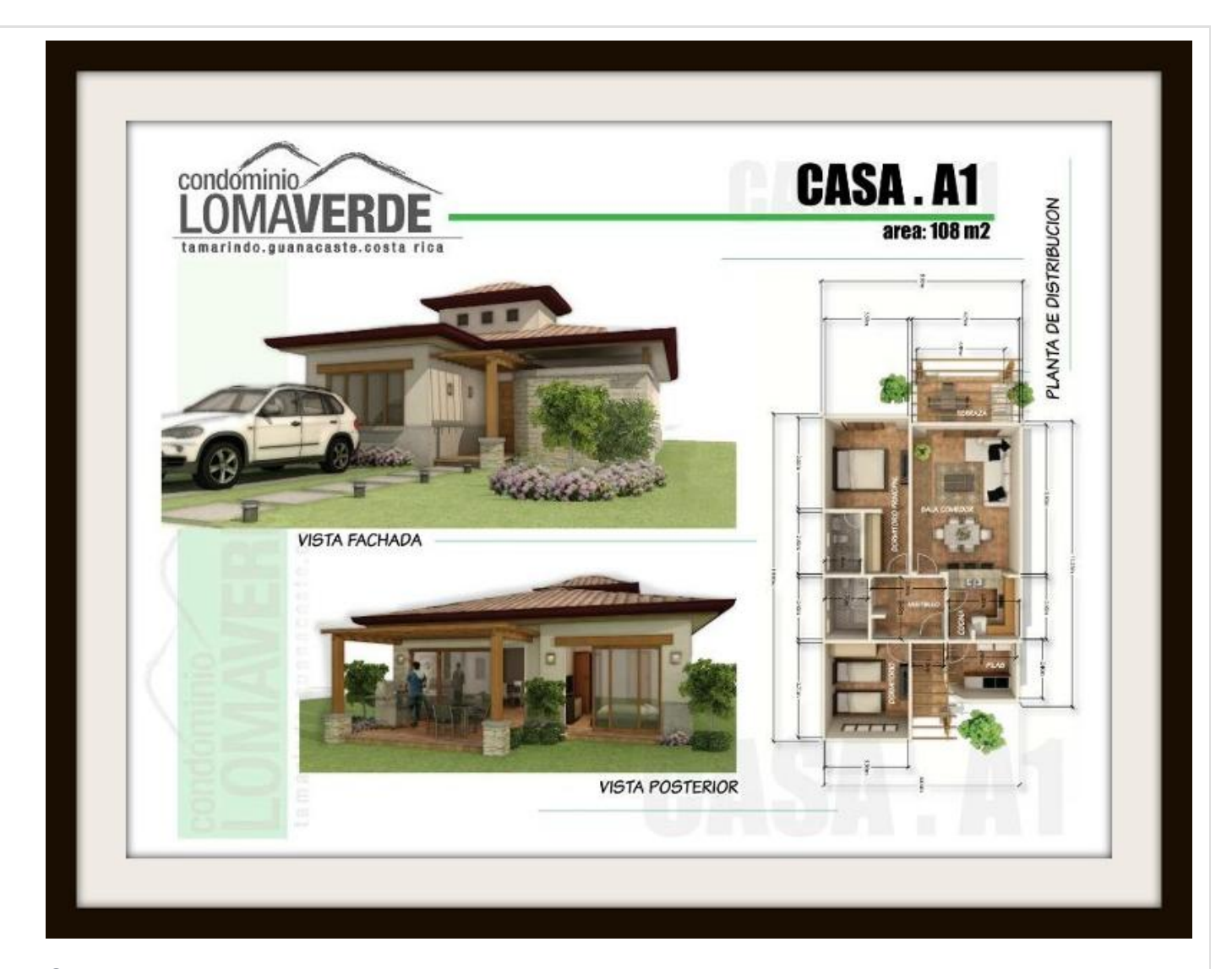
Casa A1 2 Bedroom / 2 Bath, Dining Room, Kitchen, Laundry Room and Terrace Introductory Price $ 136,500