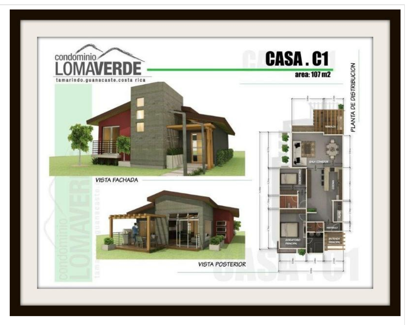
Casa C1 2 Bedroom / 2.5 Bath, Dining Room, Kitchen, Laundry Room and Terrace Introductory Price $ 146,000