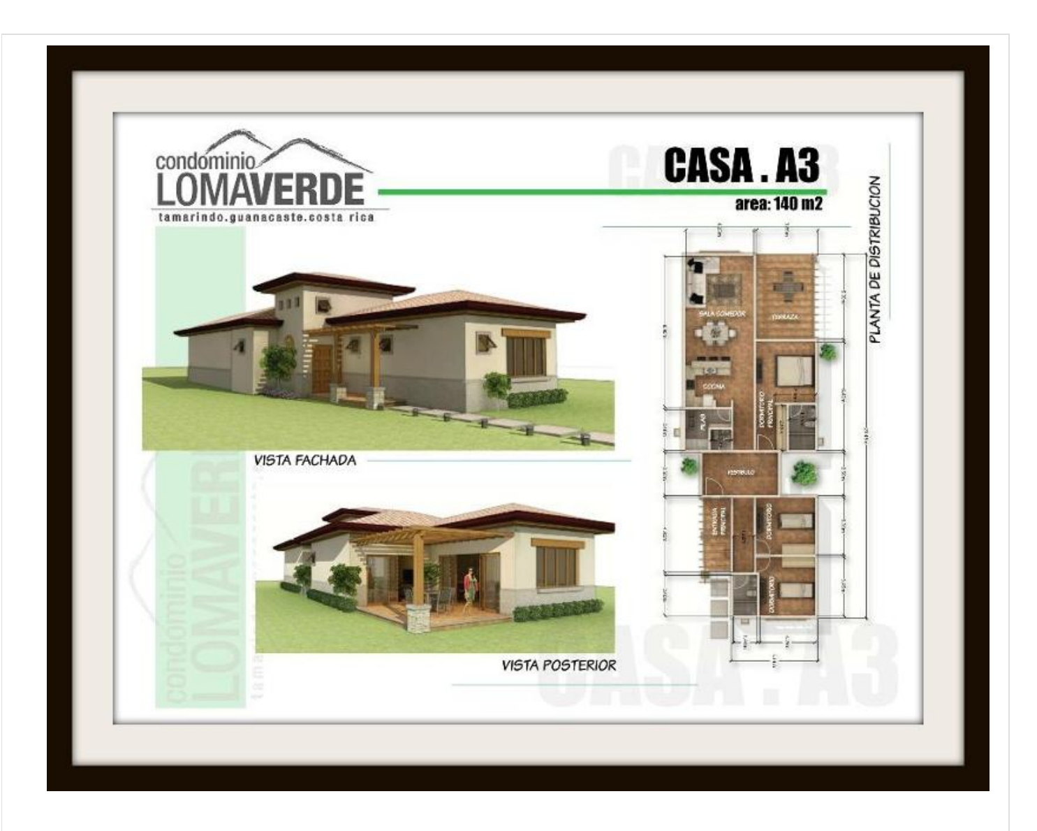
Casa A3 3 Bedroom / 2 Bath, Dining Room, Kitchen, Laundry Room and Terrace Introductory Price $ 160,500